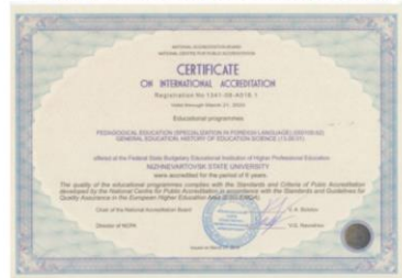
Public and professional accreditation of individual educational programs in accordance with the European standards and guidelines for quality assurance in higher education (ESG-ENQA)

2018 Federal State Budgetary Educational Institution of Higher Education "Nizhnevartovsk State University"